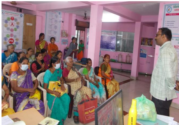
Photos of Nutrition Support Programme for the HIV/AIDS (PLHA) infected people